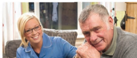
Source: American Association for Long-Term Care Insurance, 2012 LTCI Sourcebook